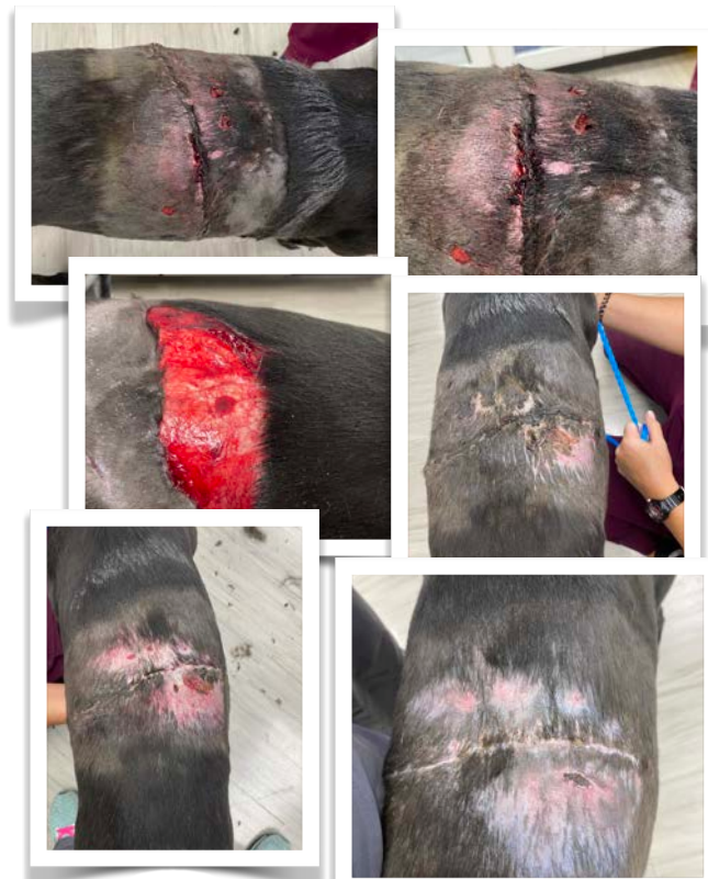
Trenton during the month of her injury.

Trenton's case was unique in that, though her wound displayed no active bleeding on presentation or during debridement, hours later she began to have seeping issues and bleeding causing bruising and swelling. All of her routine clotting profiles and factors were within normal limits. What she displayed that I had never seen and therefore what she taught me, was that greyhounds in particular can have something called accelerated fibrinolysis, or fibrinolytic syndrome. Which essentially is a cascade that